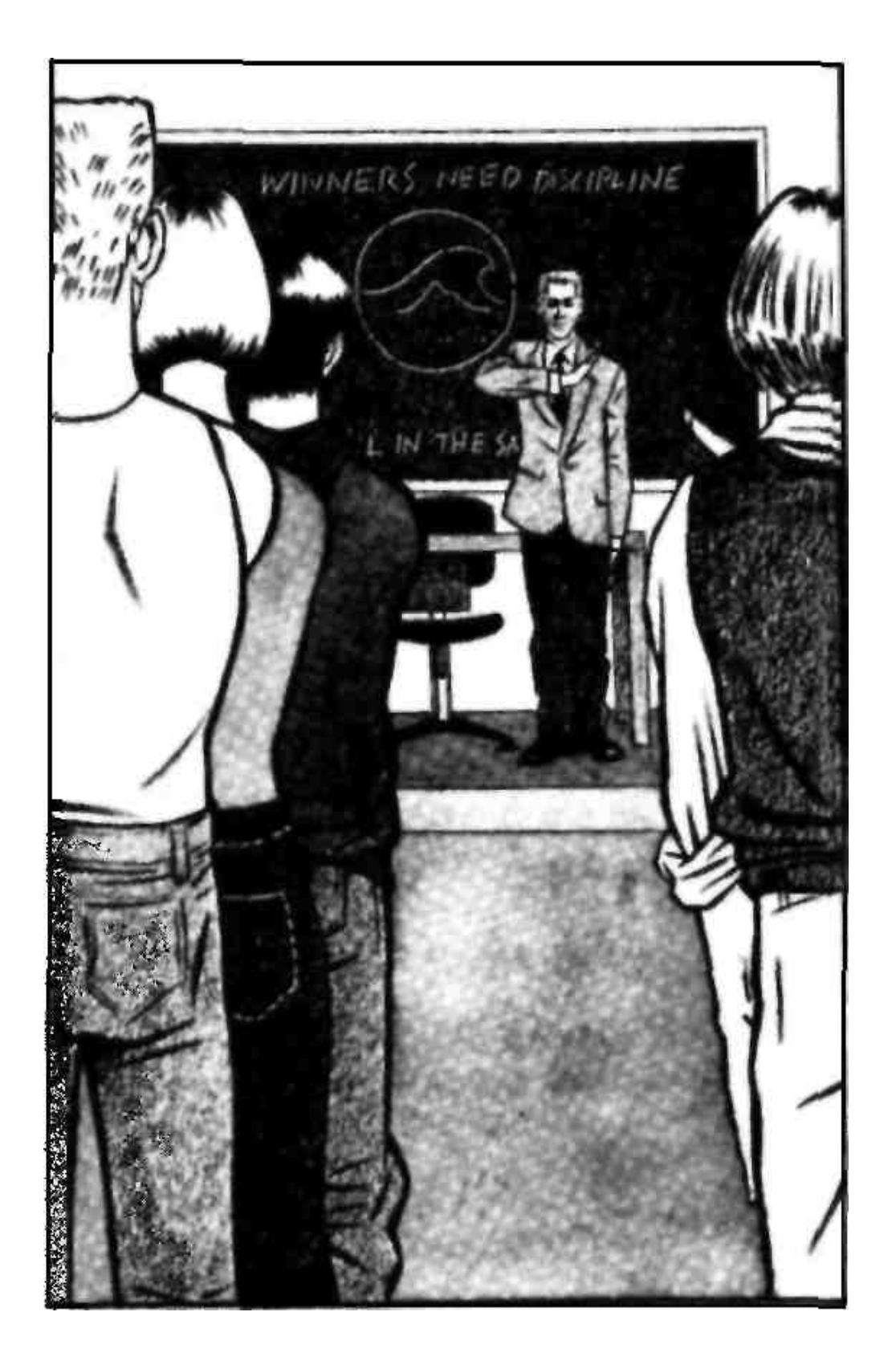
This is our salute and our salute only. When you see a Wave member, you must salute.'