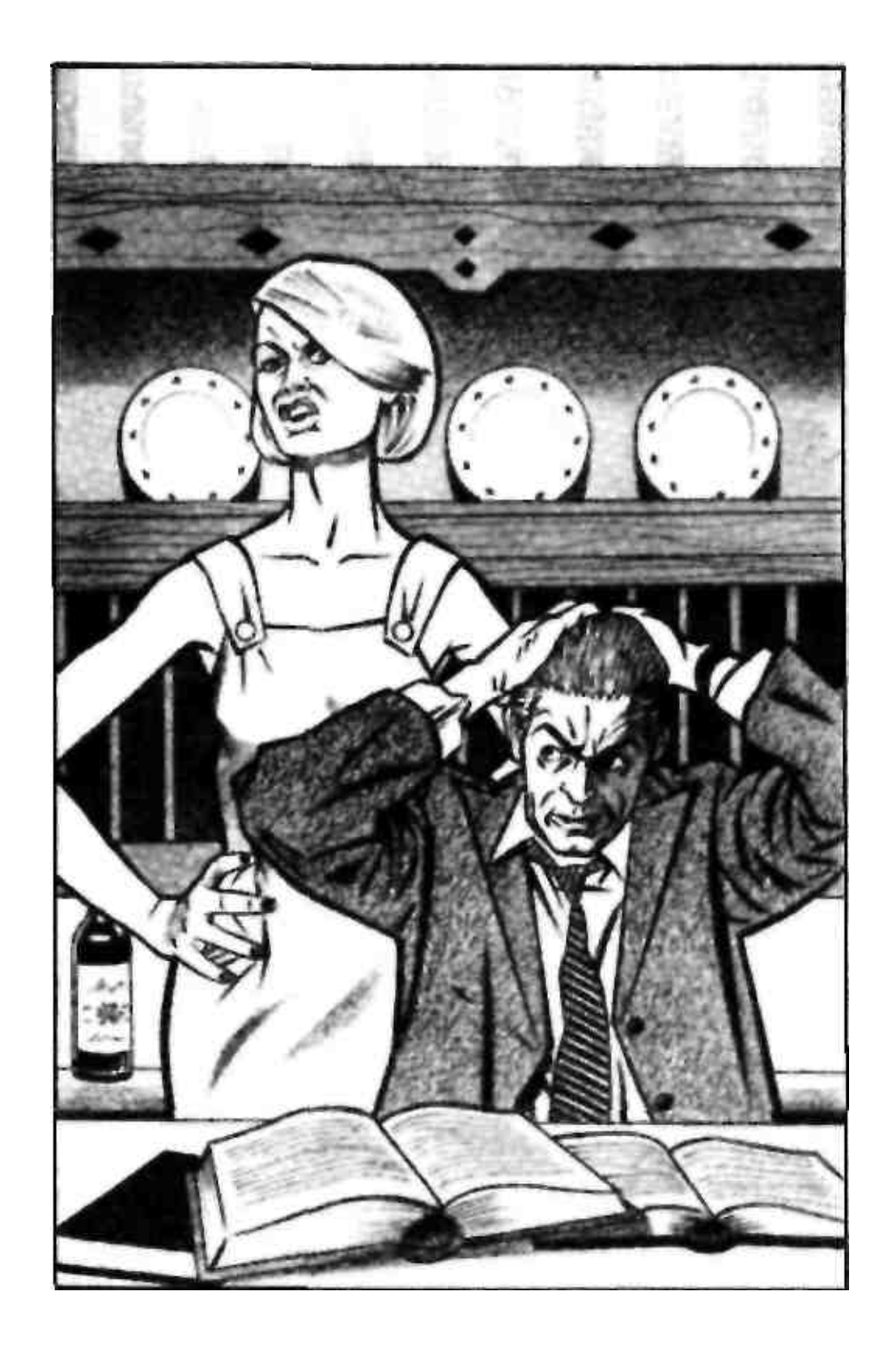
'This experiment is doing something to you. And I don't like it!